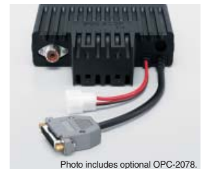
Photo includes optional OPC-2078.

The optional ACC cable allows you to connect with various external devices to control audio output, modulated signal input, remote channel control, horn honk and many more functions. OPC-1939 is a D-SUB 15-pin type and OPC-2078 is a D-SUB 25-pin type.